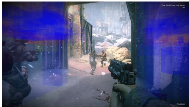
Occluded objects drawn as bounding box ghosts.

For KILLZONE 3, we wanted to produce a largely automatic occlusion system requiring less artist involvement. There are three main aspects to this work: